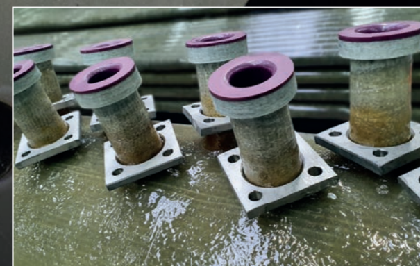
Dekadur Plus header for use in chlorine-alkali electrolysis processes.