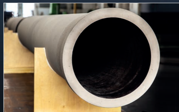
Stable, self-supporting pipelines made from KERA® with maximum chemical resistance.