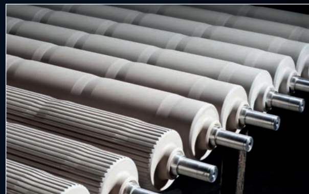
Rollers made from KERA® SP 20 used for cellulose processing, with 20 % sulphuric acid (H 2 SO 4 ) as the process medium and a working temperature of 70 °C.