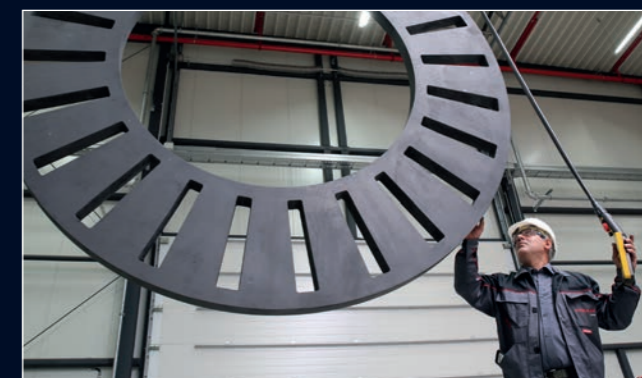
Distributor plates from KERA® 21 for a production plant for white phosphoric acid.