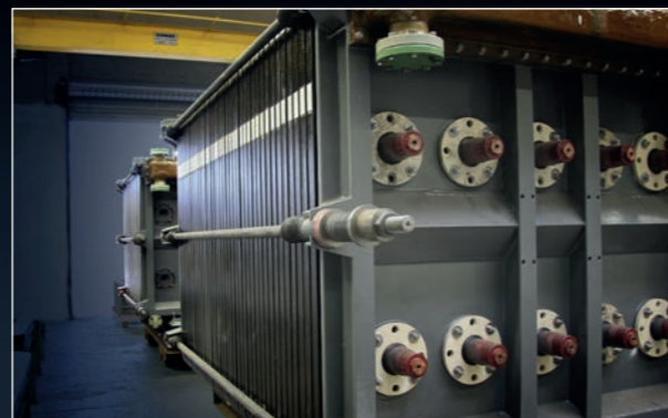
Hydrochloric acid (HCl) is separated during electrolysis with KERA® frames into chlorine gas and hydrogen.