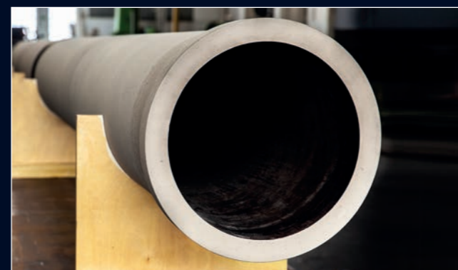
Stable, self-supporting pipelines with maximum chemical resistance.