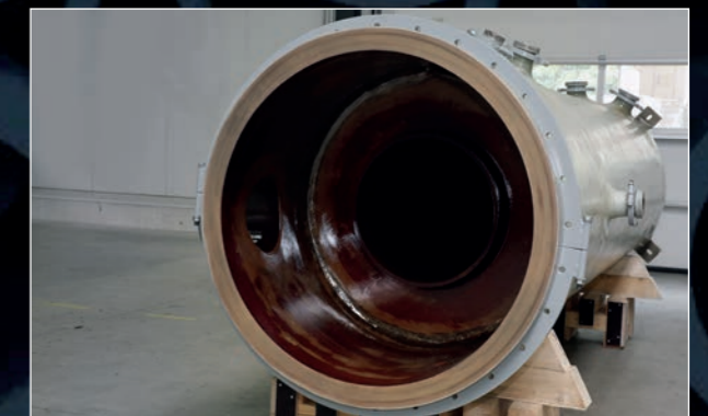
Complete HCl absorber made from KERA® SP 30 / FRP for extreme operating environments. In this case, 32 % hydrochloric acid (HCl), operating temperatures of up to 120 °C, designed for an operating pressure of -1.0 / + 0.5 bar.