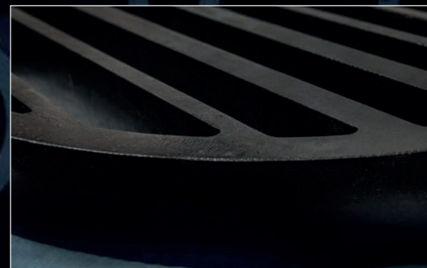
Packing support made from KERA® for use in various columns.