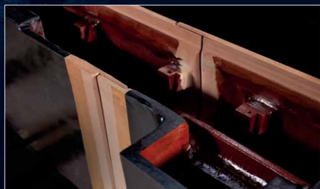
Sulphuric acid process vessel made from KERA® SP 20 in the viscose fibre industry. The many individual segments are precisely assembled and securely bonded together on site.

You can always rely on Steuler Linings: A wealth of expertise in manufacturing and processing combined with reliable service. Focusing on the individual needs of our customers, our engineers and technicians design and construct process vessels, storage tanks, piping systems and special components exactly according to specification. We deliver efficient solutions of the highest quality with the added bonus of project planning, installation and maintenance services — everything from one source. We advise and develop with you the ideal solution — from concept to on-site implementation.