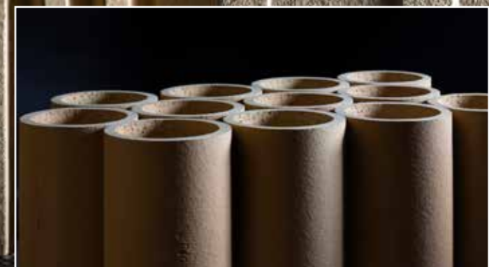
Burner pipes for tunnel kilns

Steuler kiln furniture is precision-manufactured using the dry-press or extrusion method depending on application. This results in tight dimensional tolerances of the workpieces and minimises the amount of post-processing required, a big advantage when it comes to automating production lines. The raw materials we use, in particular cordierite, andalusite and bauxite, are characterised by excellent thermal shock resistance – a key requirement for rapid kiln cycles.