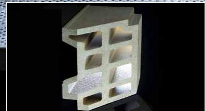
Border blocks for tunnel kiln cars