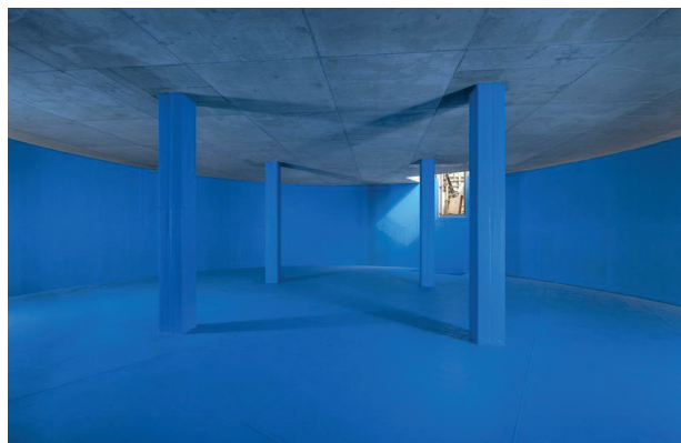
Above picture: Lining 400™ enables the completely lined potable water tank to meet hygiene requirements while reducing maintenance costs and extending service life.