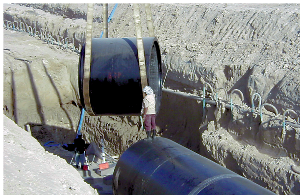
Above picture: Pipe installation.