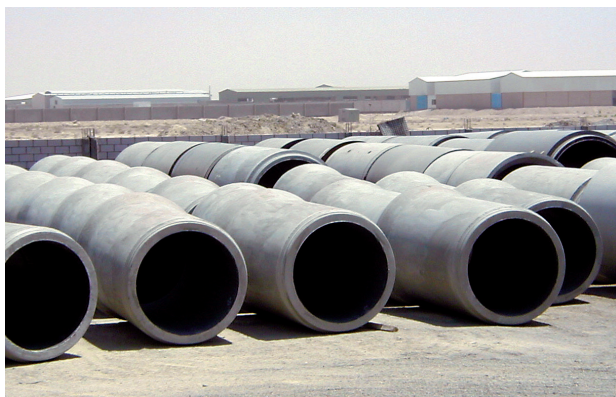
Above picture: Prefabricated, reinforced concrete pipes with LINING 400™.