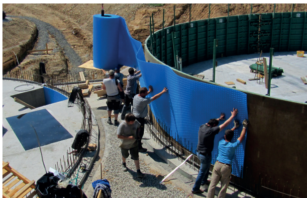
Above picture: Prior to pouring the concrete, the polyethylene bands are laid in the wall formwork and joined with sections.

For our customers, this means one point of contact for all product questions, ensuring a high level of efficiency in the project process.